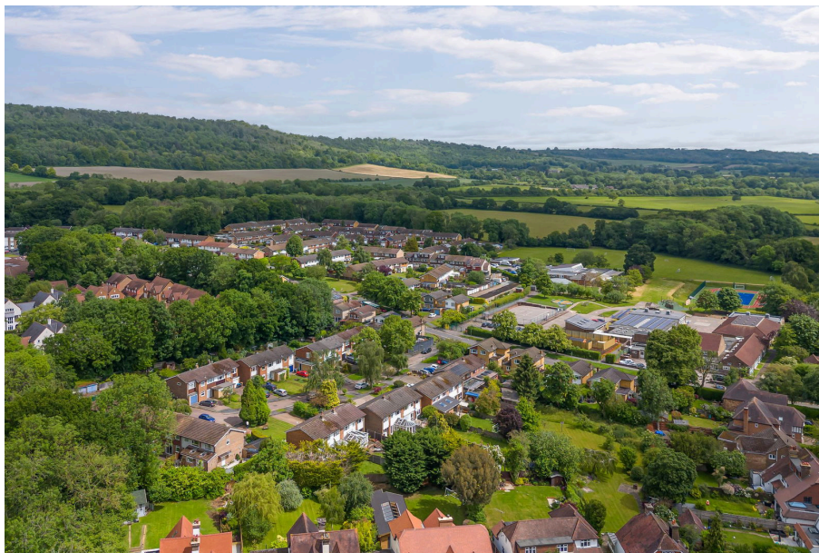
Woodland Court, Oxted Approximate floor area 1338 sq m / 1454 sq ft